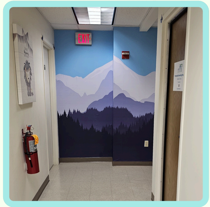
A mountainscape mural painted on the wall at the end of the hallway.

Stay tuned for details of an Open House of the Beaver County office taking place in April once the renovations are complete.