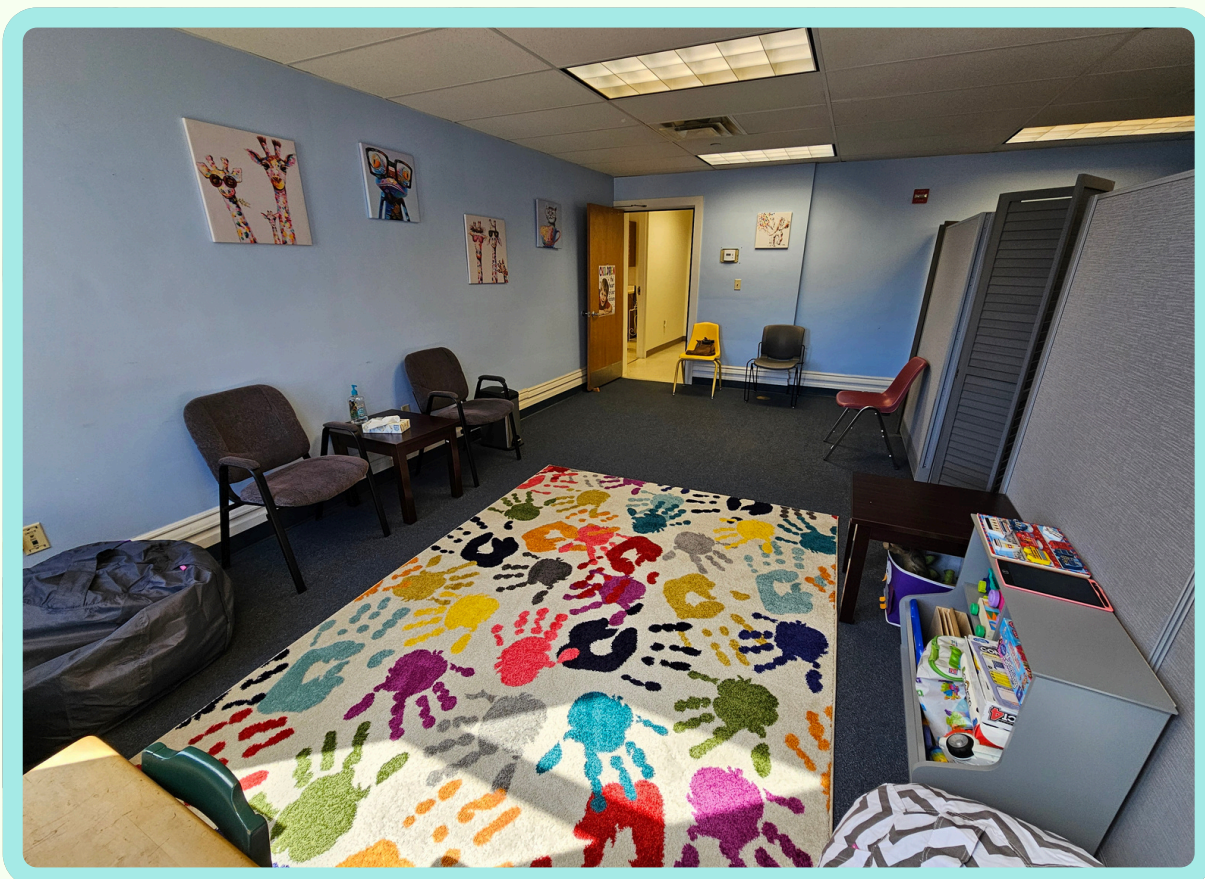
Beaver County Office Waiting Room