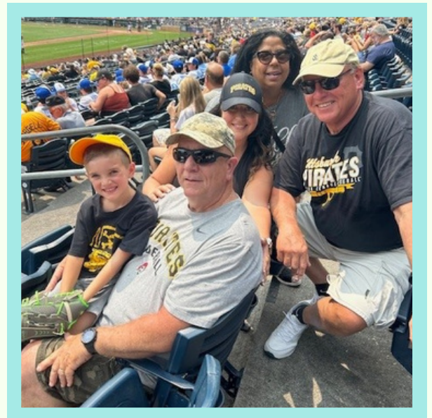
Our ACP Law Enforcement Liaisons at a Pirate Game.

CPS laws, expectations of the district attorney's office, the need for medical exams, acronyms for CPS, and an overview of ACP child advocacy center. Workshop two focuses on minimal facts interviewing, forensic interviews, and provides interactive activities for participants. Workshop three focuses on a thorough training on medical findings (physical & sexual abuse), as well as interactive activities for all participants.